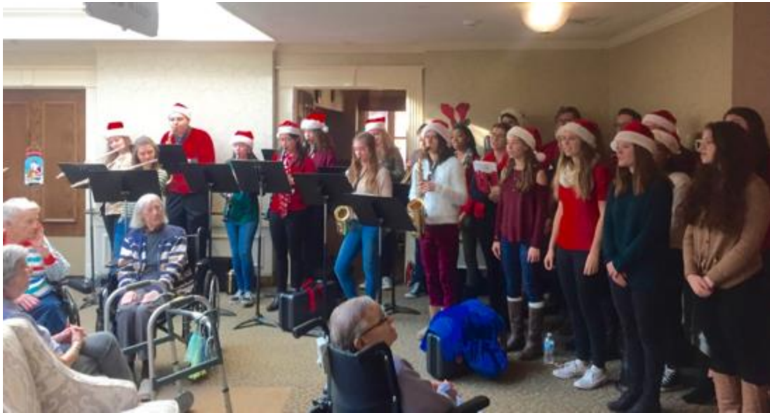
Performing at Suffield House

The Music Department also participated in the holiday donation program through the Network Against Domestic Abuse. SHS/MBA Music Department students raised over $1,500 and sponsored 3 kids. Collectively, we made a monetary donation, bought numerous individual gifts and purchased three gift certificates for bicycles at a bike shop. We would like to give a heartfelt thank you to all parents, students and community members who contributed to this program.