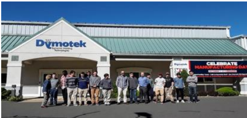
Manufacturing Day at Dymotek Corporation in Ellington, CT – exploring robotics, engineering and manufacturing careers.