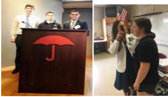
Students participate in the Actuarial & Analytics Day at Travelers. (Left)