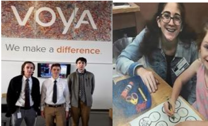
Learning about the field of business at Voya Financial. (Left)