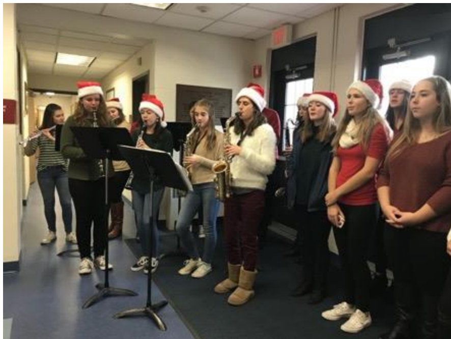
Performing at Town Hall

Winter Concert Date: January 15th, 7p.m. (SNOW date 1/17/19)